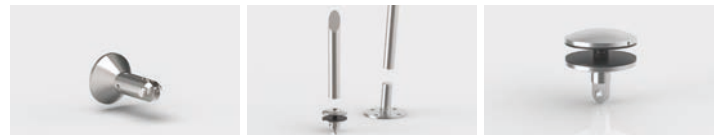
2x 1981VA 1x 1989VA-5G 2x 1926VA