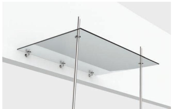
TYP A-02 TYPE A-02