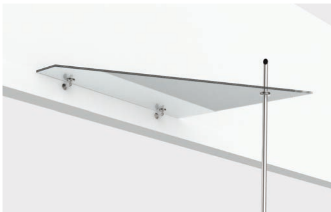
TYP A-01 TYPE A-01